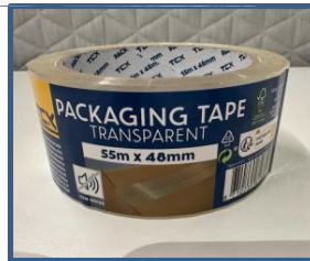
Foto del artículo Picture of the item

El objeto descrito se ajusta a la legislación pertinente de armonización de la Unión: